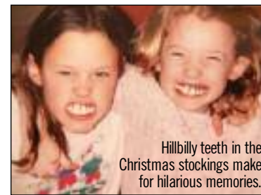
Hillbilly teeth in the Christmas stockings make for hilarious memories.

try the library plus Netflix has a great selection. Have little ones? Be creative. If you are watching How the Grinch Stole Christmas , dress up as "Whoville" citizens and eat "roast beast" for dinner.