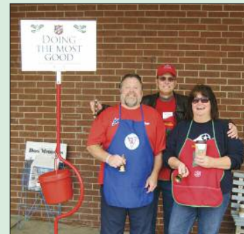
Members of the Mustang Club of Greater Kansas City helping as bell ringers at Christmas.

"As always, volunteers are critical to the overall success of our Red Kettle